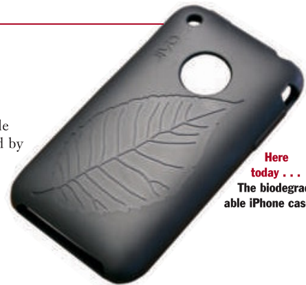
Here today . . . The biodegradable iPhone case